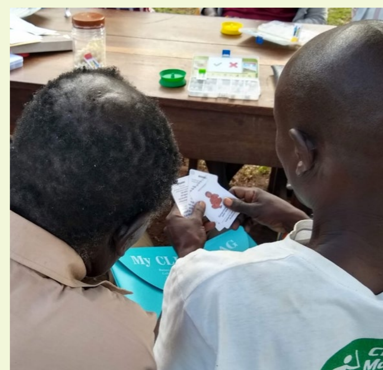
Two men discuss a joint decision in the game