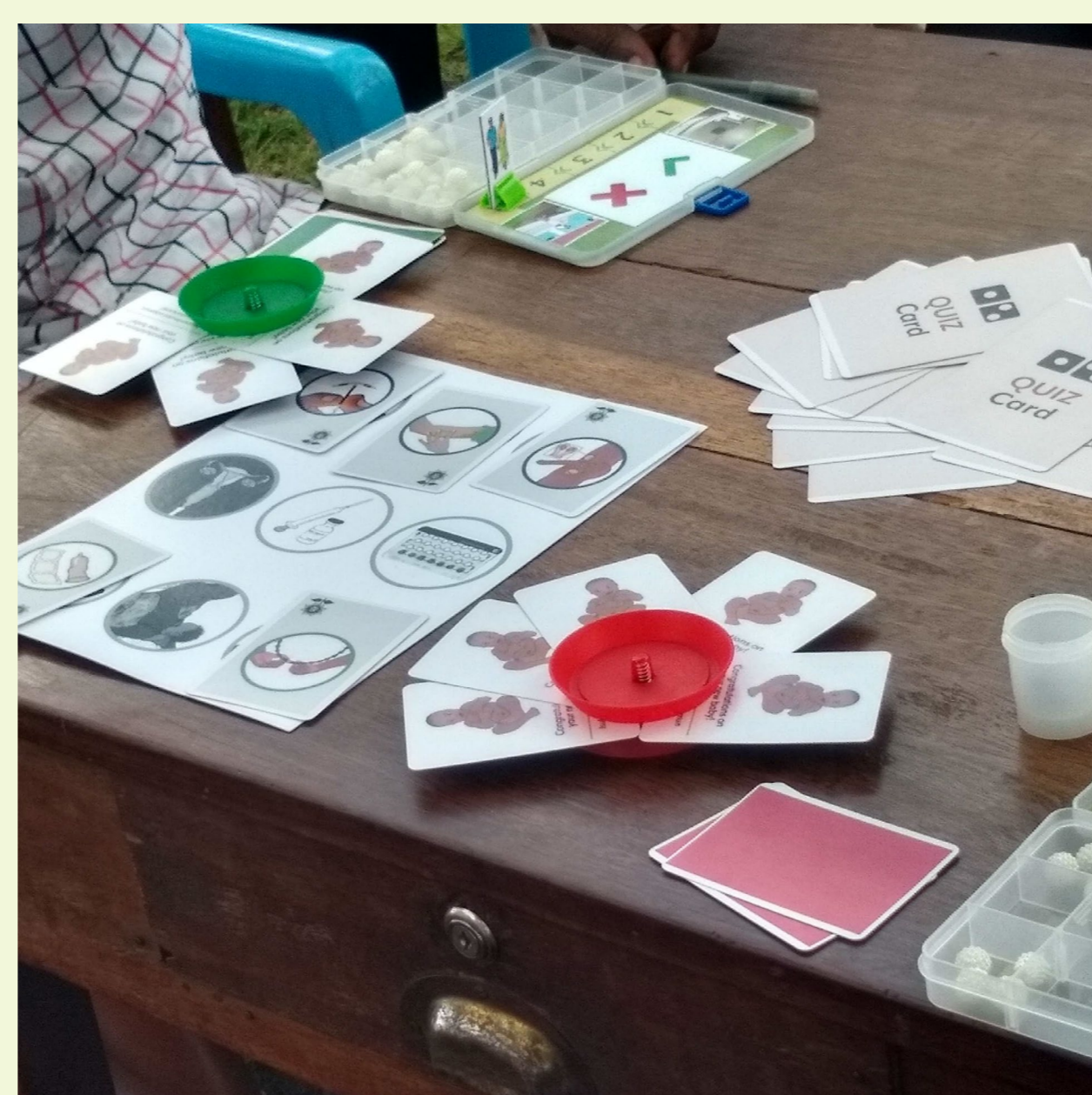
Elements of the game on display in Uganda