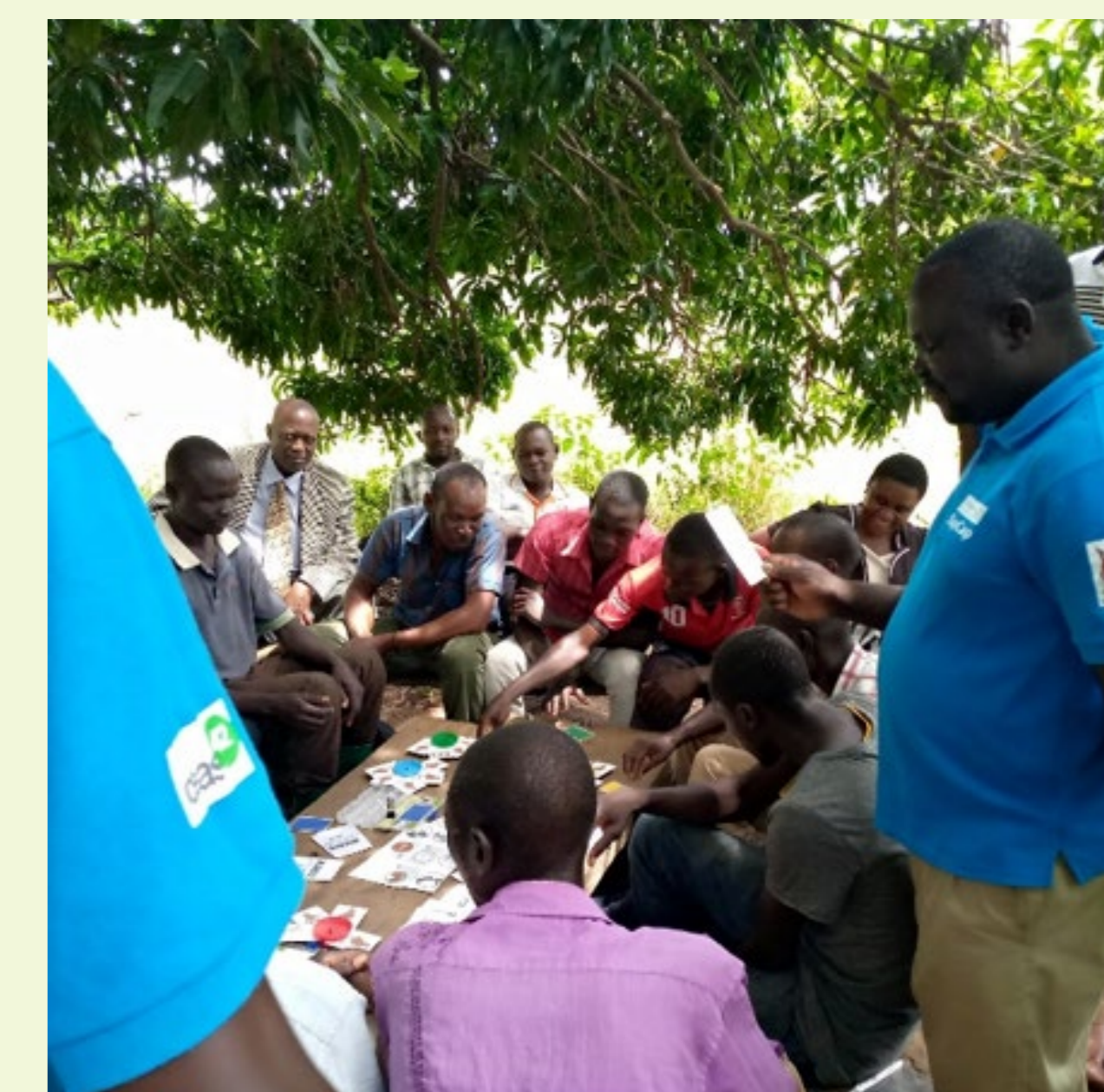
Community Health workers facilitate game play