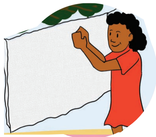
Airing to dry