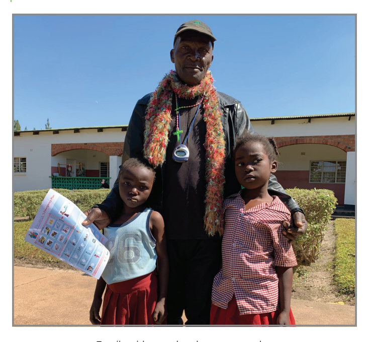
Family with completed emergency plan

Follow-up: When a health provider sees any instance in which parents delayed seeking care, at the end of the interaction they will ask the parents if they have completed an emergency plan. If the parents have not yet made one, the provider will encourage the parent to create one at the next under-five clinic or PNC visit, as well as to add their name to a list for CBVs to use to conduct a follow-up visit at their home. If the family has already made a plan, and if the provider has time, the CBV will review the plan with them to think about what did not work well and what could be done differently next time to ensure the child is brought promptly. If the provider does not have time, they will add the family to the list for a CBV follow-up home visit.