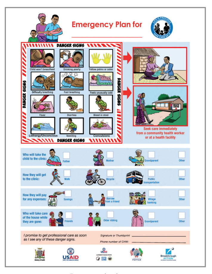
Emergency plan document

Emergency planning is an activity and accompanying worksheet that community-based volunteers (CBVs) and community health workers (CHWs) conduct with parents of young children at under-five clinics, postnatal care (PNC) visits, and home visits in the community. The worksheet shows warning signs and symptoms for which parents should bring a child to the health facility. It also asks parents to think about and write down a plan for how they will bring a child to the facility if they do see any warning signs. The purpose of emergency planning is to reduce ambiguity around when it is necessary to seek care and to help parents anticipate, plan for, and overcome common logistical barriers to care seeking. The full set of design materials can be found in the Appendix.