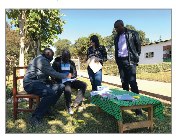
Providers and clients filling out emergency plan

Health provider orientation: District health promotion officer and/or implementing partner staff should hold a brief one- to two-hour orientation at each facility to inform the health providers about the emergency planning activity.