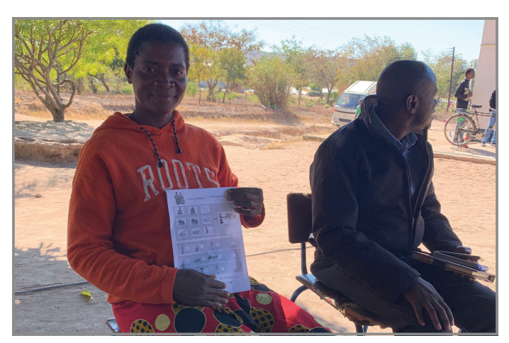
Client with emergency plan

The full Problem Definition Report and Social and Behavioral Diagnosis Memo produced by Breakthrough ACTION can be found in the <u>Appendix</u>.